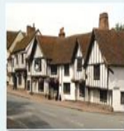
Swan Hotel, Lavenham t 01787 247477 e info@theswanatlavenham.co.uk