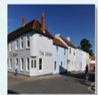
The Crown, Woodbridge t 01394 384242 e info@thecrownatwoodbridge.co.uk

Prices based on double occupancy in an Aldeburgh room Upgrades available –*all subject to availability Return travel from Aldeburgh to Ipswich Marina can be arranged for a supplement of £25 pp